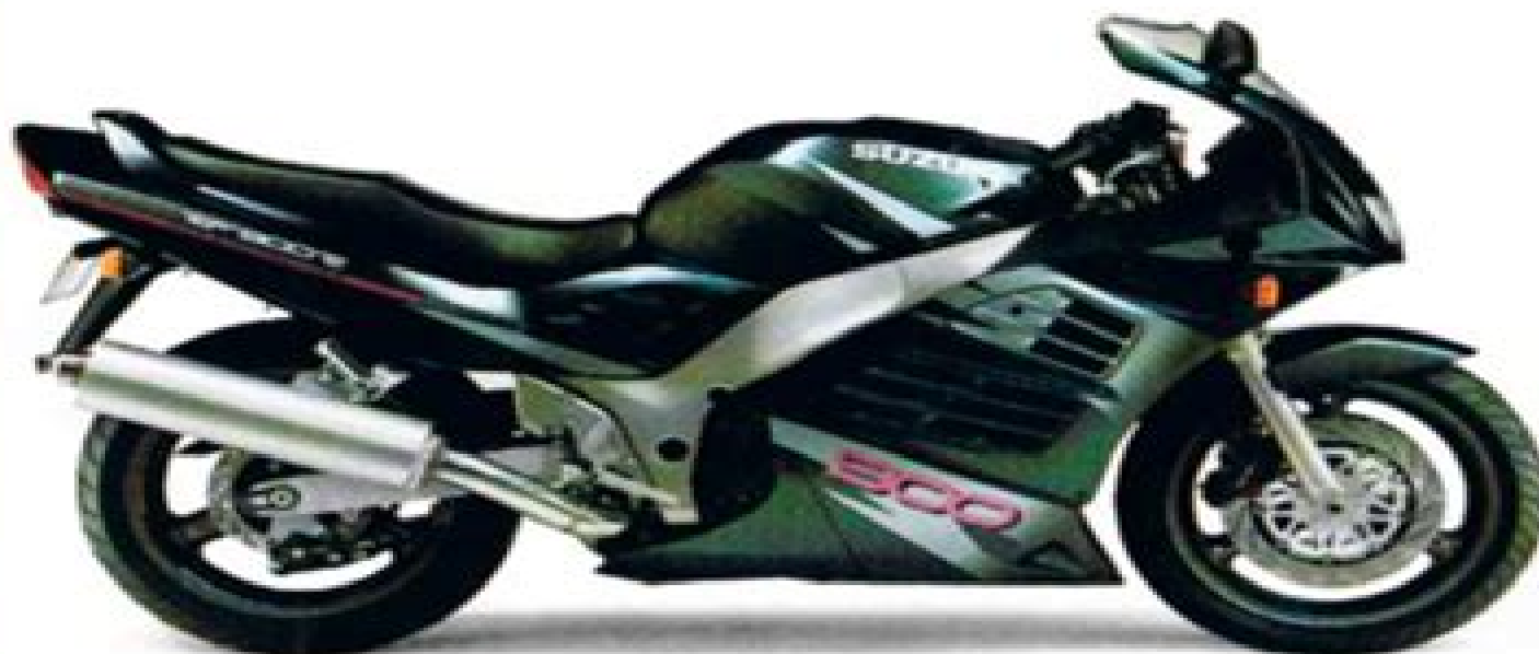
Suzuki RF900R 1994 - 1997