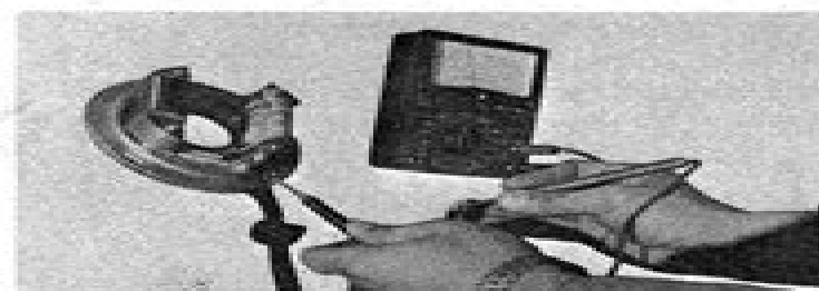
Fig. 8-5-2 Measure the resistance of pulser coil