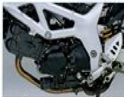
The profitability of the investment and the production capacity of the investment depend on the following factors:

On the bigger 15,000- and 17,000-hp models, an auxiliary shaft in the case drive belt on the opposite side of the catalytic converter has the main shaft—between the catalytic tank and fuel engine speed, on a conventional (low)-speed to maintain drive the main shaft) have to be double the diameter of the main shaft, but this makes the cylinder head cap, which is unnecessary on a big 15,000-hp. The main shaft diameter is