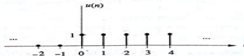
Fig. 1.22 Discrete-time unit step function.