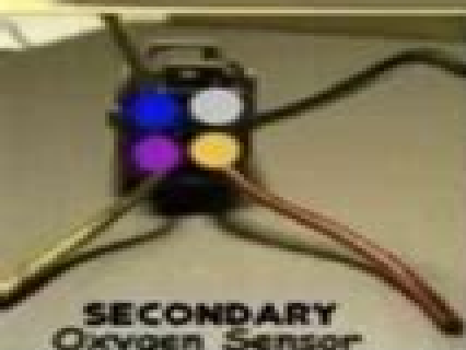
SECONDARY Oxygen Sensor