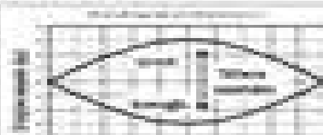
A standing wave

Two standing waves (the same wave) are shown. The first wave is a standing wave. The second wave is a standing wave. The first wave is a standing wave. The second wave is a standing wave.