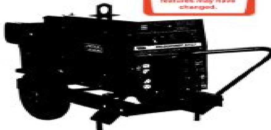
Briggs & Stratton Engine