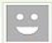
AISHA IS WRONG!!!