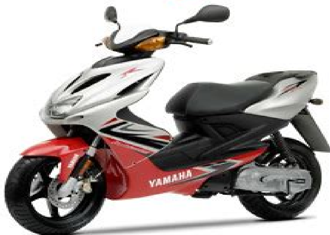
Yamaha YQ50 Aerox 1997 - 2006