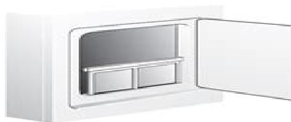
Clean lint screen after every load.