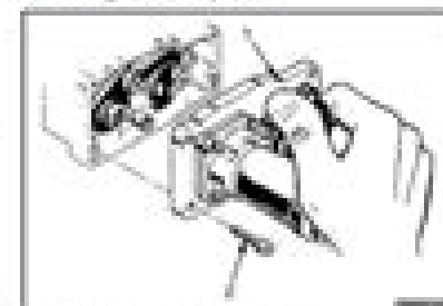
1. THROTTLE DRIVE ASSEMBLY SCREW

The spring for the throttle lever has tension. Hold throttle valves closed, then rotate cam for throttle lever clockwise. Rotate cam until ball joint for throttle cable is in 11 o'clock position. See Figure 65. This procedure will prevent damage to throttle drive assembly.