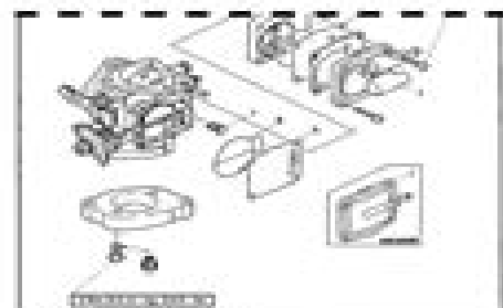
ENGINE AND TRANSMISSION ASSEMBLY