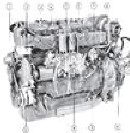
Fig. 4 Engine engine, TAMD60

The fuel system is well protected from interruptions during running by means of electrically operated fuel filters. On the TAMD60 engines the fuel injection pump is fitted mounted onto the other engine from the pump fitted in a block.