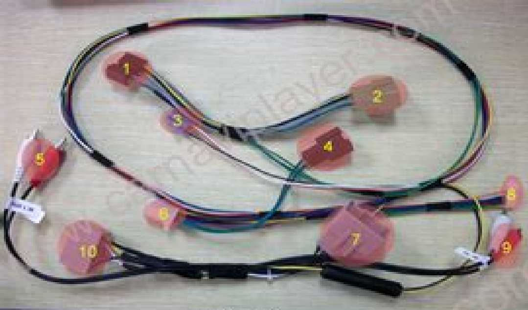
A. Wiring Diagram