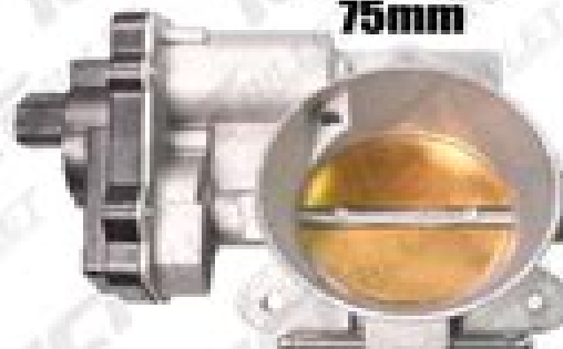
Gen 3 Truck 75mm