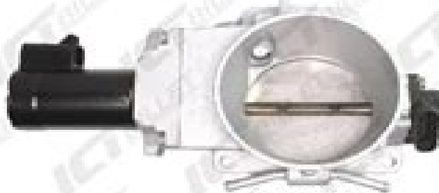
Gen 3 Truck 75mm