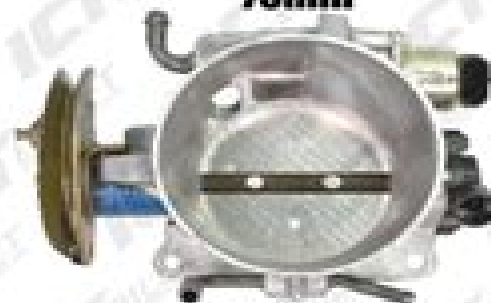
Gen 3 w/o TCS 75mm