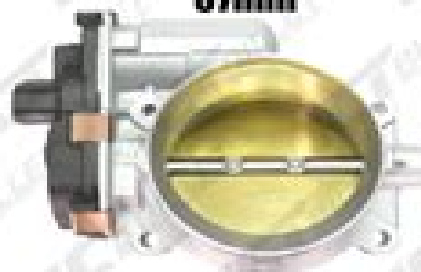
Gen 4, LSA, LS9 87mm