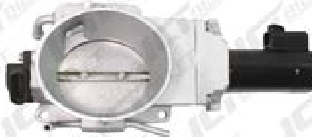
Gen 3 Corvette 75mm