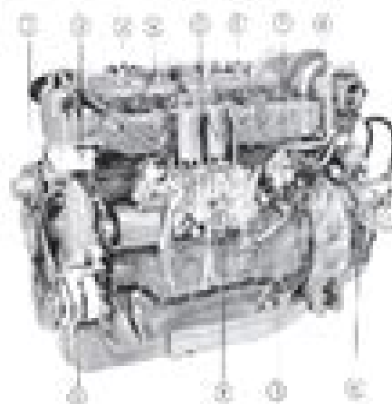
Fig. 4 Engine engine, TAMD60

The fuel system is well protected from interruptions during running by means of an electric, replaceable fuel filter. On the TAMD60 engines the fuel injection pump is large mounted under the other engine from the pump fitted on a bracket.