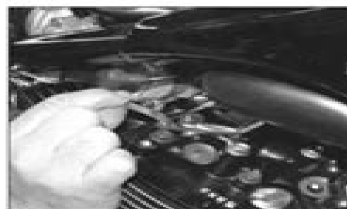
14.13a Slip the feeler gauge between the rocker arm and valve stem . . .

1 With the engine stopped, make sure the throttle grip rotates easily from fully closed to fully open with the front wheel turned at various angles. The grip should return auto-