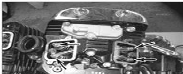
14.13b . . . there are two intake valve adjusters and two exhaust valve adjusters per cylinder (arrows)

3 Freeplay adjustments are made at the handlebar end of the cable. Loosen the locknut on the cable where it leaves the handlebar (see illustration). Turn the adjuster until the desired freeplay is obtained, then retighten the locknut.