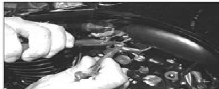
14.15 Hold the lock-nut and turn the adjusting screw