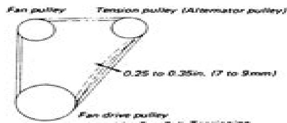
Fig. 38. Fan Belt Tensioning

The fan belt tension is adjusted by moving the alternator bracket in or out. The belt is properly tensioned when the belt deflection midway between the alternator pulley and the crankshaft pulley is 0.25 to 0.35 in. (7 to 9 mm) with a force of 20 lbs applied. Proper belt tension is essential for good engine cooling and belt life. See Fig. 38.