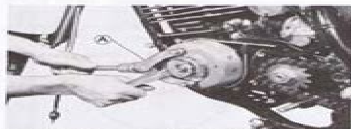
Fig. 5. Hold the rotor with special tool ① (09930-40113), and unscrew the nut securing the rotor.

NOTE: To facilitate engine removal, have the magneto rotor and stator removed, as shown in Figs. 5 through 7: