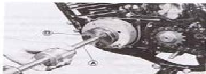
Fig. 6. Draw out the rotor by operating the special tools ① ② (09930-30101) (09930-30150) as shown.