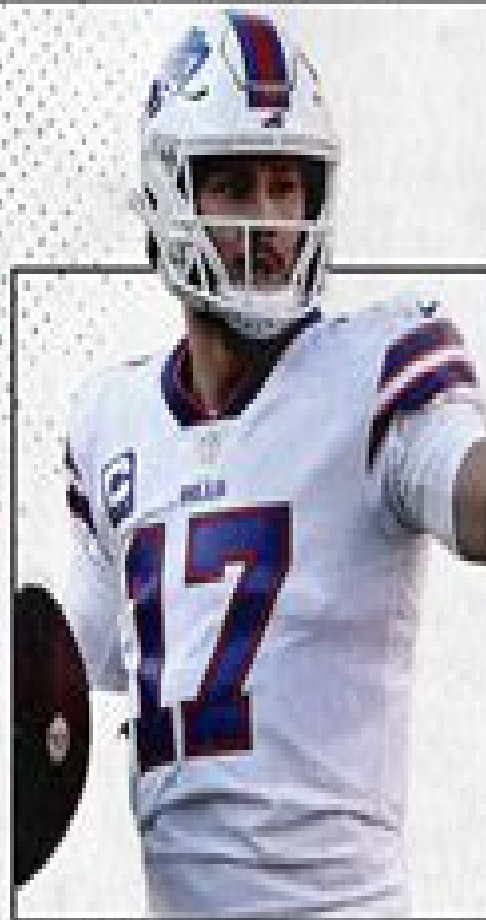
JOSH ALLEN — BILLS