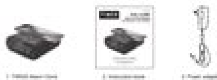
1. Product box (folded and sealed)

The product ships with the following items. Make sure all are present.