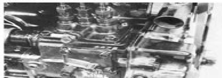
Location of Engine Number

(Note : Each model including the swirl chamber types are numbered serially.)