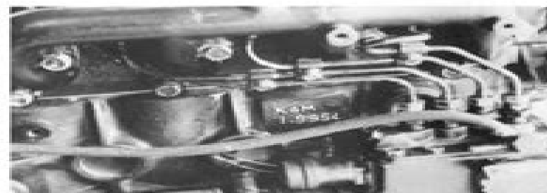
Engine Model and Total Displacement