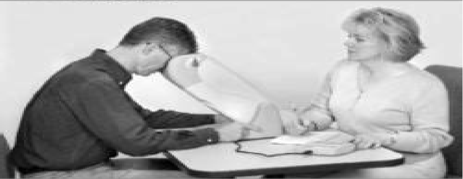
Titmus V4 / Titmus V2