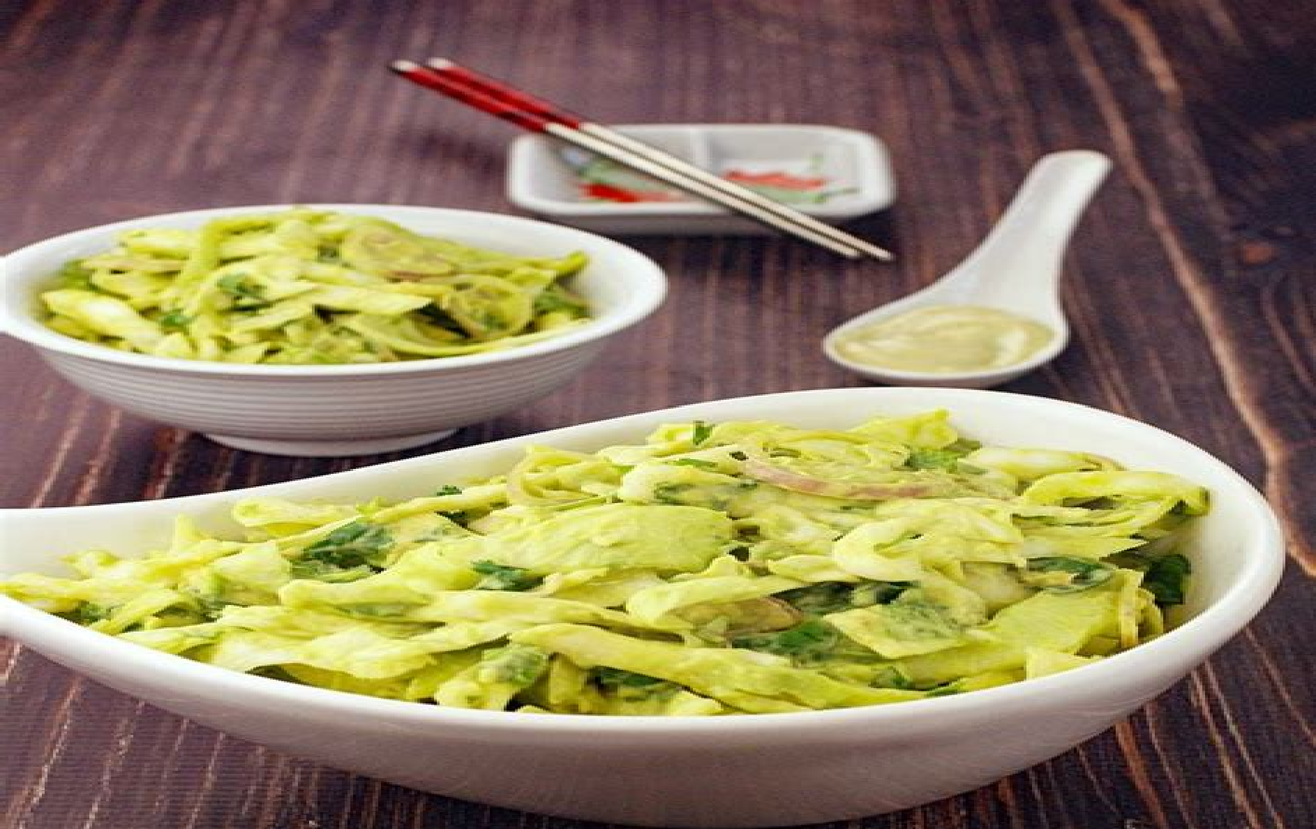
Wasabi Cole Slaw