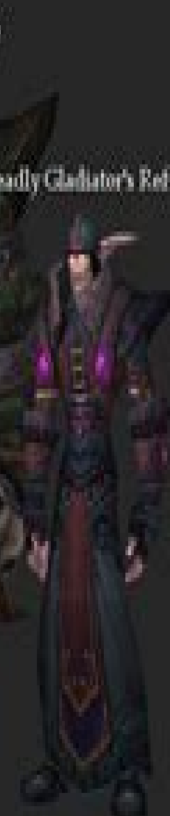
Season 5 high