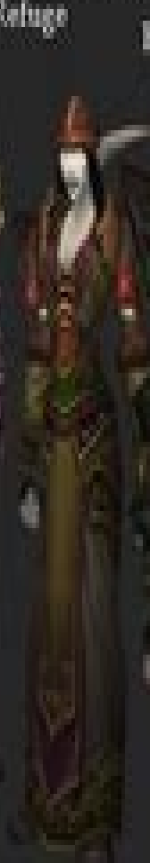
Season 5 low