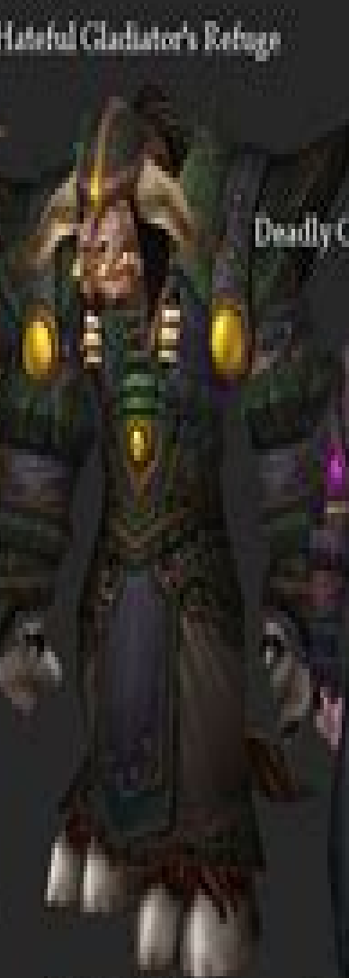
Season 5 medium