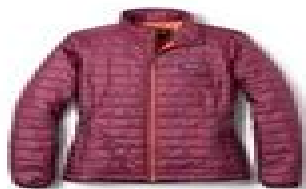
MID WEIGHT LAYER