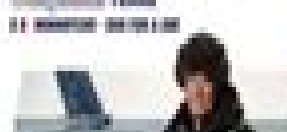
Jean LE CAM FR FRANCE