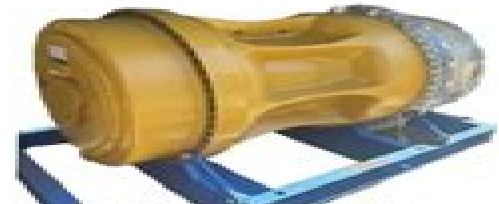
789C/D FINAL DRIVE RECON OUTRIGHT: $180,000+gst ea.