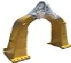
785/789C/D A FRAME RECON OUTRIGHT: $40,000+gst ea.