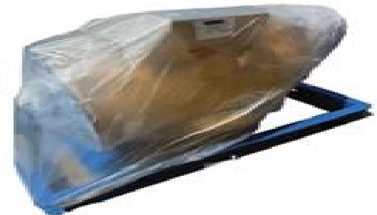
789C TRANSMISSION RECON OUTRIGHT: $120,000+gst ea.