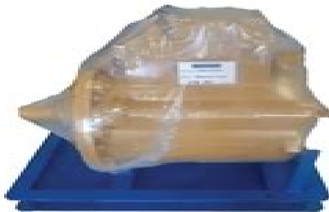
D11R/T TRANSMISSION RECON OUTRIGHT: $80,000+gst ea.