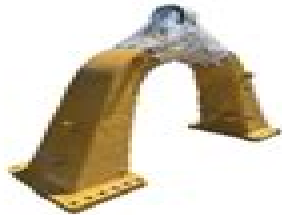
793C/D/F A FRAME RECON OUTRIGHT: $50,000+gst ea.