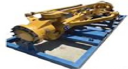
24M FRONT AXLE GROUP RECON OUTRIGHT: $140,000+gst ea.