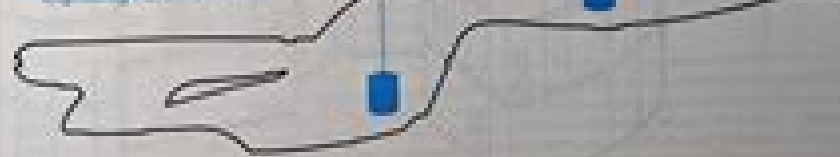
4.1.1 Location of main computer cores