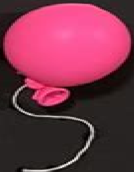
Air in the balloon