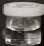
Water in the container