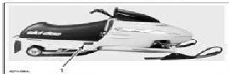
1. Vehicle serial number