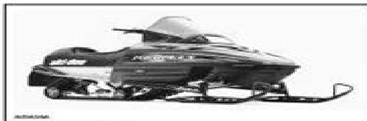
TYPICAL — S-SERIES