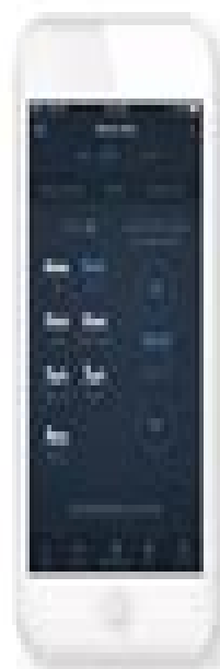
Adjust and save your favorite bed position.