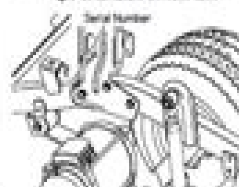
Fig. 4 Serial Number on Rear Frame