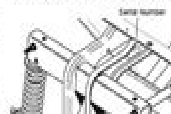
Fig. 3 Serial Number on Front Frame