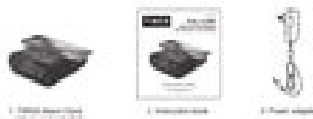
1. Product box (folded and sealed)

The product ships with the following items. Make sure all are present.