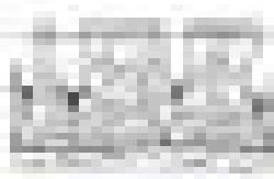
Stratified Cuboidal Epithelium