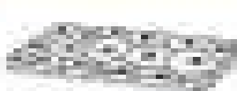
Simple Columnar Epithelium

What is the most abundant of all tissues that cover the body's surface? What is the most abundant of all tissues that cover the body's surface?