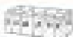
Simple Columnar Epithelium