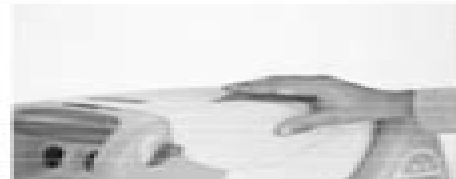
Incorrect Position of wheel