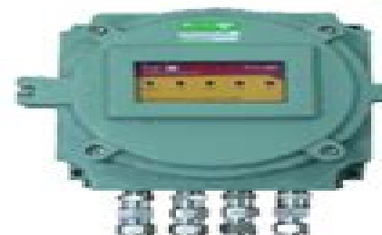
Ex - Proof