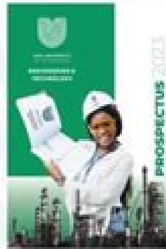
ENGINEERING AND TECHNOLOGY