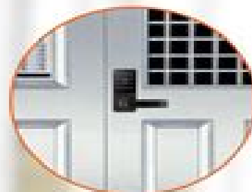
Stainless Steel Doors