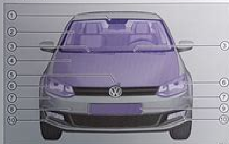
Fig. 2 Overview of the front of the vehicle