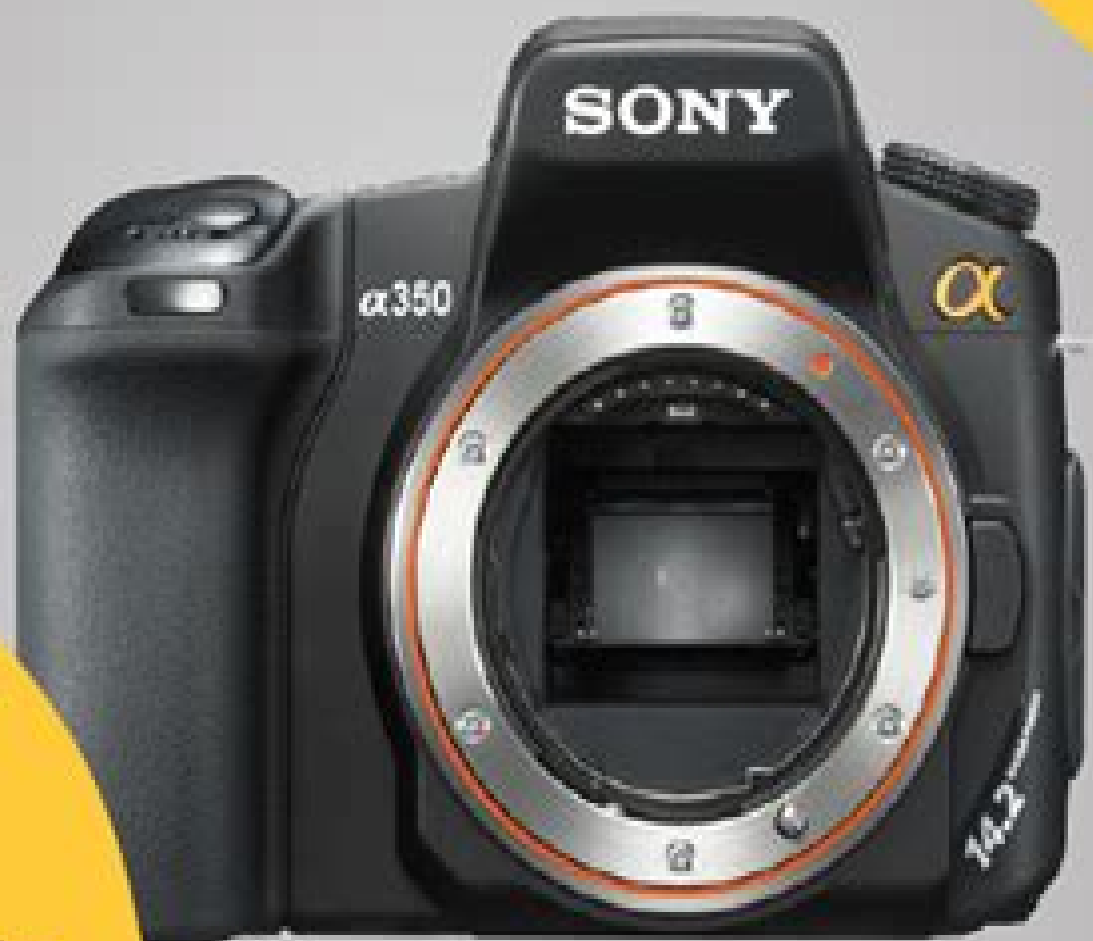
Sony Alpha 350