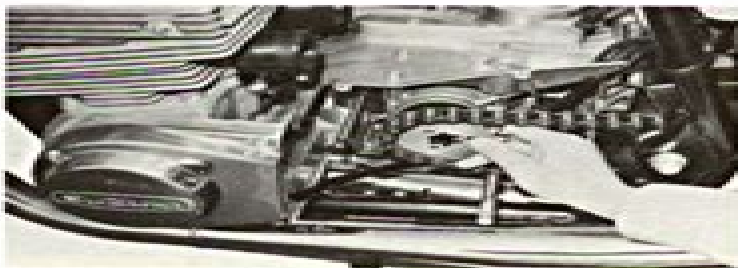
Fig. 7-1-20 Removing drive sprocket