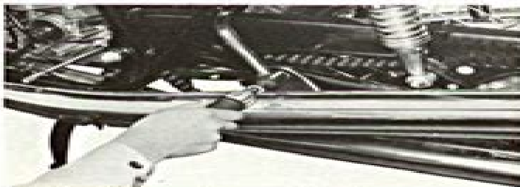
Fig. 7-1-22 Removing rear footrest