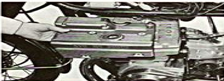
Fig. 7-1-21 Removing cylinder head covers