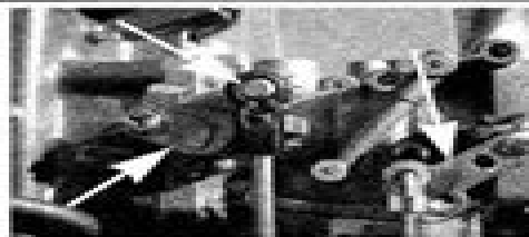
Fig. 11 Various lubrication points on the powerhead should be maintained regularly to ensure a long service life including all rotating...