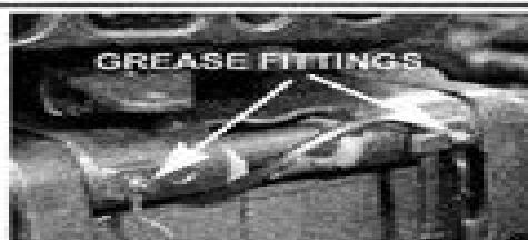
Fig. 14 The swivel bracket usually contains one or two grease fittings