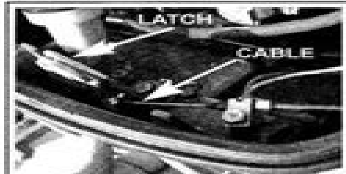
Fig. 16 Any cawling clamps and/or cables should also be lubricated with Yamaha All Purpose Grease