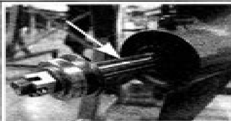
Fig. 15 The propeller should be removed periodically to clean and re-grease the prop shaft splines