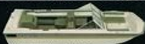
17' Capri I.O. (and O.B.), page 22.