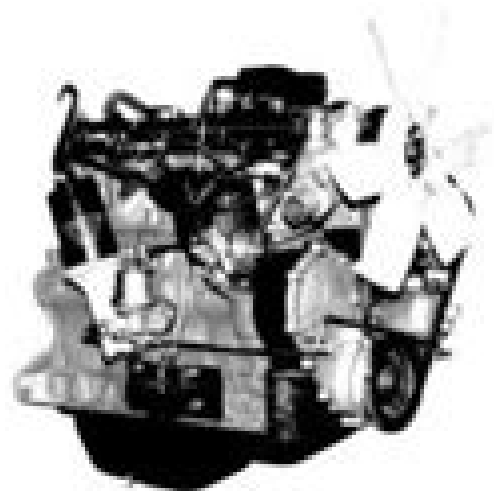
41 Engine Exterior View