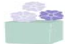
Square or Cube Vase