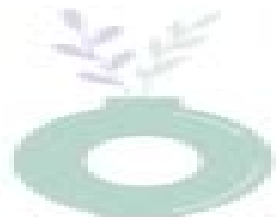
Hollow Circle Vase