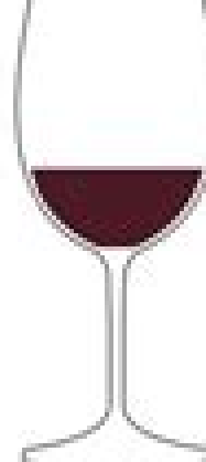
Bold Red Wine Glass