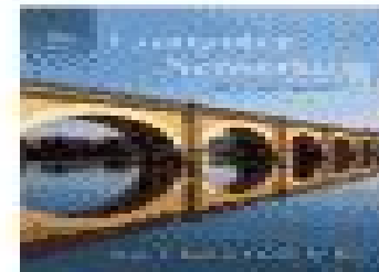
Computer Networking: A Top-Down Approach, 4 th edition.