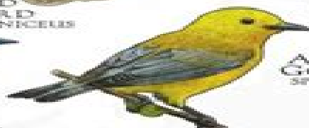
PROTHONOTARY WARBLER PROTONOTARIA CITREA