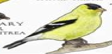
AMERICAN GOLDFINCH SPINUS TRISTIS