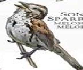
SONG SPARROW MELOSPIZA MELODIA