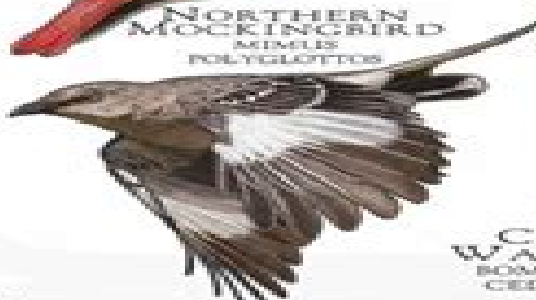
NORTHERN MOCKINGBIRD MIMUS POLYGLOTTOS