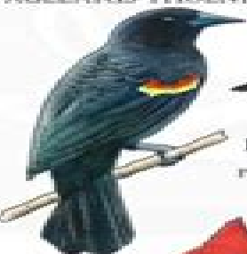
RED- WINGED BLACKBIRD AGELAIUS PHOENICEUS