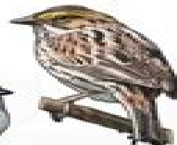
SAVANNAH SPARROW PASSERILLUS SANDWICHENSIS