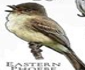
EASTERN PHOEBE SAYORNIS PHOEBE